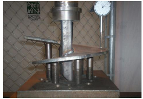
Helix Strength Test