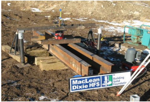
Full scale field testing-compression/tension/lateral

MacLean-Dixie Helical Piles and Anchors undergoing rigorous testing at an IAS accredited lab to ICC AC358 Acceptance Criteria For Helical Foundation Systems and Device. Ongoing quality control program per AC10 with inspections by an IAS accredited inspection agency per AC98