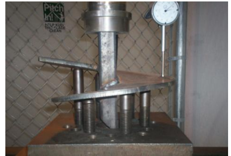
Helix Strength Test