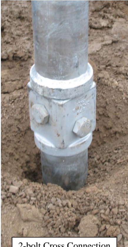
2-bolt Cross Connection