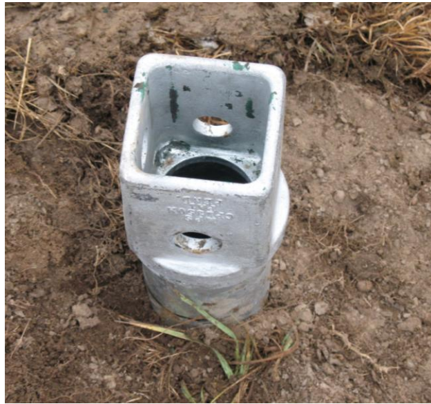
Pipe pile and coupling system remains undamaged during installation

Conventional Pipe Piles - Elongated/torn holes with round pipe pile coupling & bolts in shear.