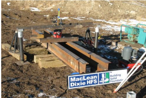
Full scale field testing- compression/tension/lateral

MacLean-Dixie Helical Piles and Anchors undergoing rigorous testing at an IAS accredited lab to ICC AC358 Acceptance Criteria For Helical Foundation Systems and Device. Ongoing quality control program per AC10 with inspections by an IAS accredited inspection agency per AC98