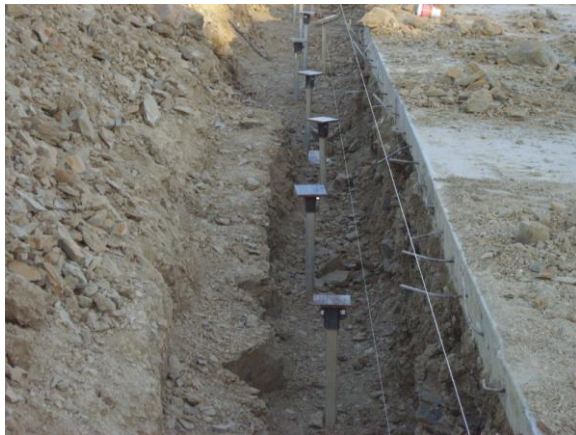
Typical New Construction Application

MacLean-Dixie Helical Piles and Anchors undergoing rigorous testing at an IAS accredited lab to ICC AC358 Acceptance Criteria for Helical Foundation Systems and Devices. Ongoing quality control program per AC10 with inspections by an IAS accredited inspection agency per AC98