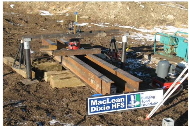
Full Scale Field